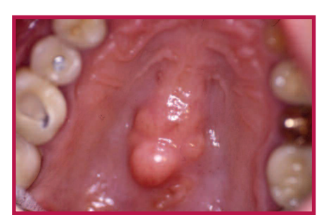
Figure 4. Complete soft-tissue healing (August 17, 2006).